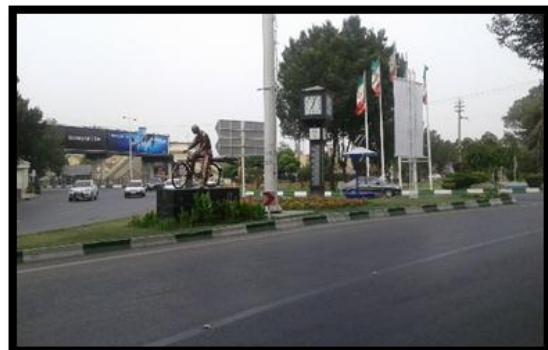
Fig 5 Azadi Square of the Yazd city (Western entrance to Farrokhi street)