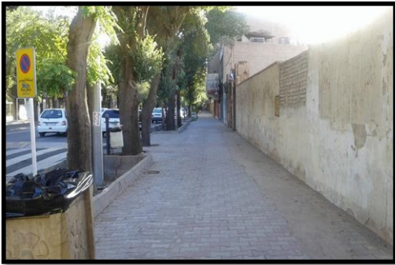
Fig 2 Northern Pedestrian path in the Farrokhi Street of Yazd city