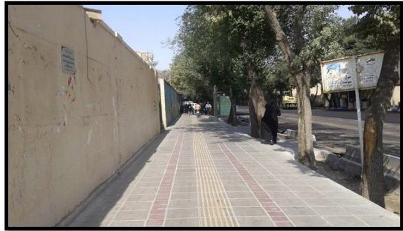
Fig 3 Southern Pedestrian path in Farrokhi Street of Yazd city