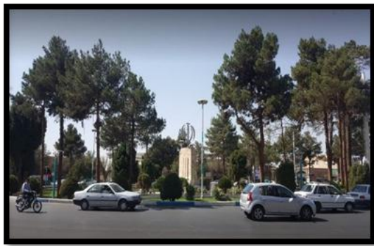
Fig 4 Shahid Beheshti Square (Eastern entrance to Farrokhi street)